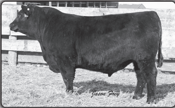
Ridl Next Step 619 - Lot 6