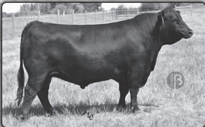
Bruns Archer 533 - Reference Sire B