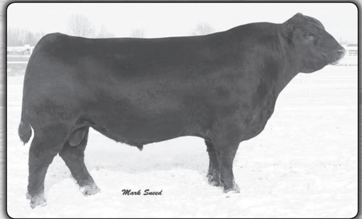
Sitz Upward 307R - Maternal Grand sire of Lot 29