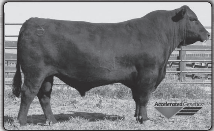
AAR Ten X 7008 SA - Sire of Lot 46