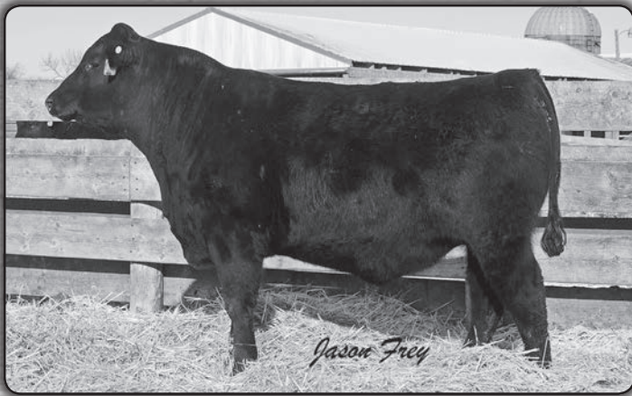
Ridl Big Sky 643 - Lot 9