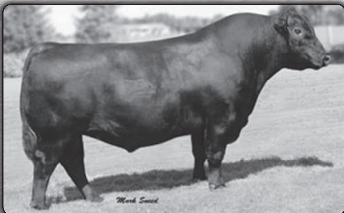
Connealy Right Answer 746 - Maternal Grand sire of Lot 45