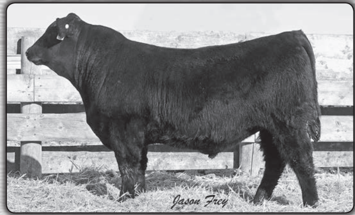
Ridl Next Step 608 - Lot 4