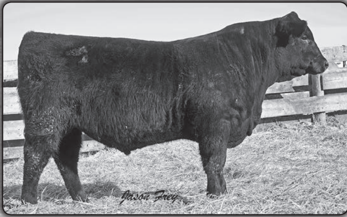
Ridl Tour of Duty 636 - Lot 14