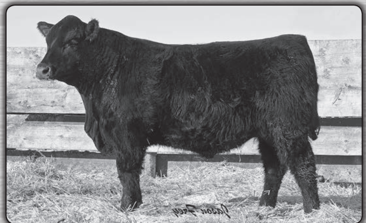
Ridl Big Sky 680 - Lot 13