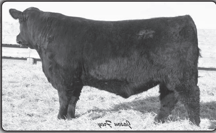
Ridl Arsenal 612 - Lot 5