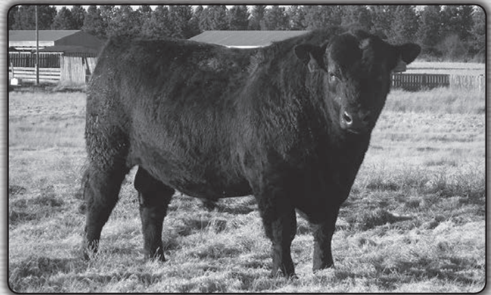
DL Consensus 462 - Reference Sire G