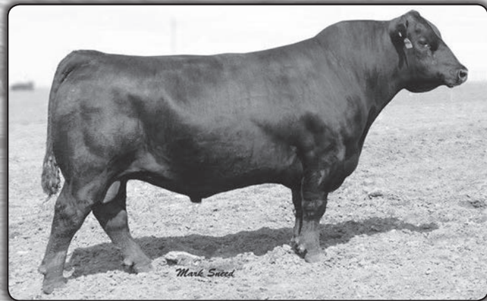
SydGen Mandate 6079 - Maternal Grand sire of Lot 38