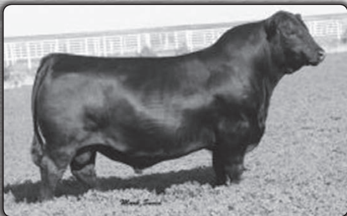
Prairie Pride Next Step 2036 - Reference Sire D