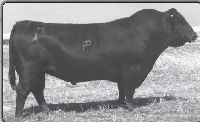
HA Image Maker 0415 - Maternal Grandsire of Lot 22