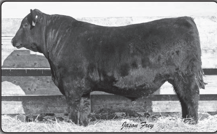
Ridl Next Step 601 - Lot 1