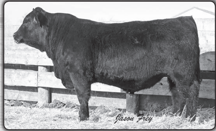
Ridl Aviator 646 - Lot 3