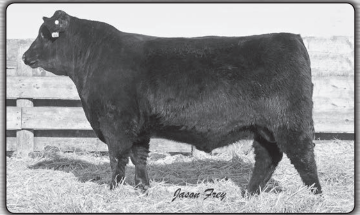
Ridl Arsenal 61 - Lot 8