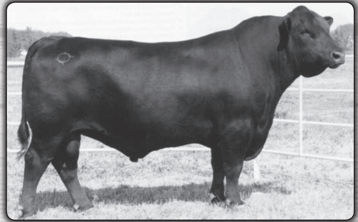
Mytty In Focus - Maternal Grand sire of Lot 34