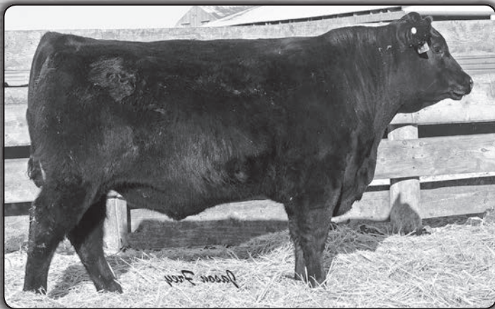
Ridl Archer 672 - Lot 15