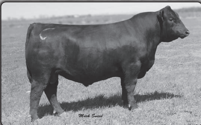
Connealy Arsenal 2174 - Sre of Lots 26 & 27