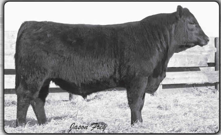
Ridl Fortitude 669 - Lot 16

• Actual weaning weight of 822. Suitable for heifers.