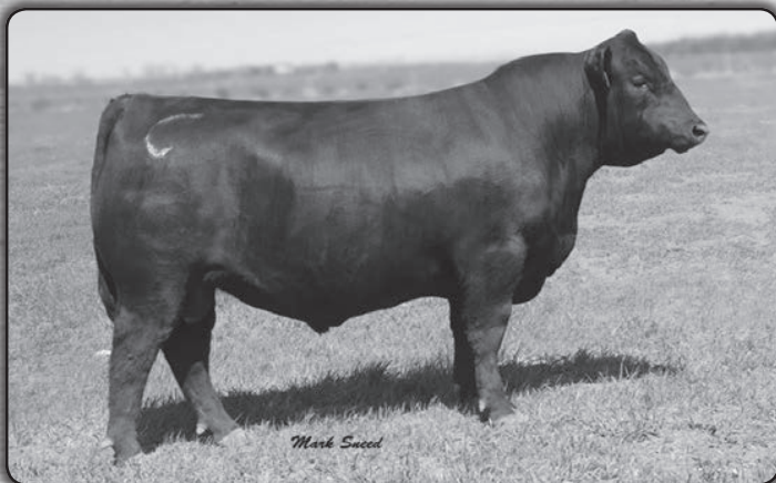
Connealy Arsenal 2174 - Reference Sire A