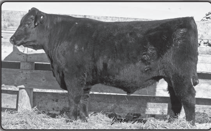
Ridl Archer 639 - Lot 2

• Actual Weaning weight of 816. Dam is a Pathfinder.