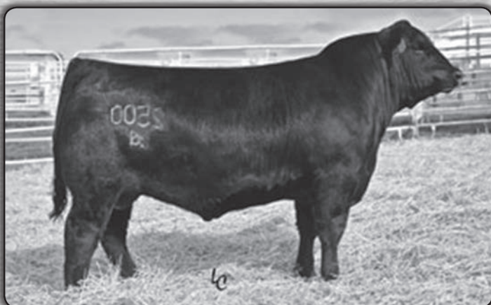
PA Fortitude 2500 - Reference Sire C