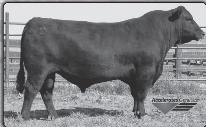
AAR Ten X 7008 SA - Maternal Grandsire of Lots 20 & 24