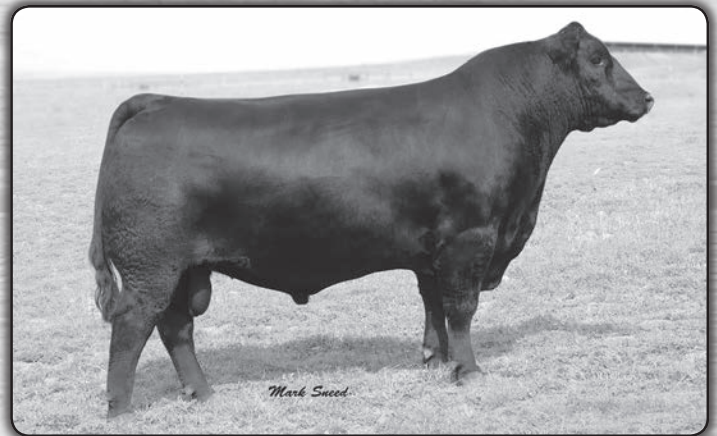
Hoover Dam - Maternal Grand sire of Lot 41