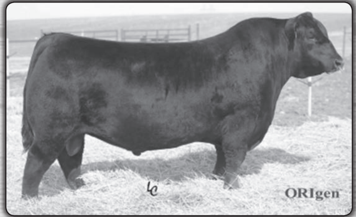
RB Tour of Duty 177 - Reference Sire E