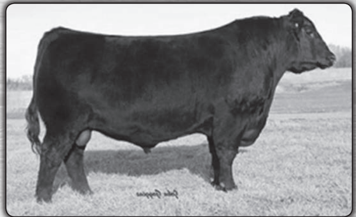
Musgrave Big Sky - Reference Sire F