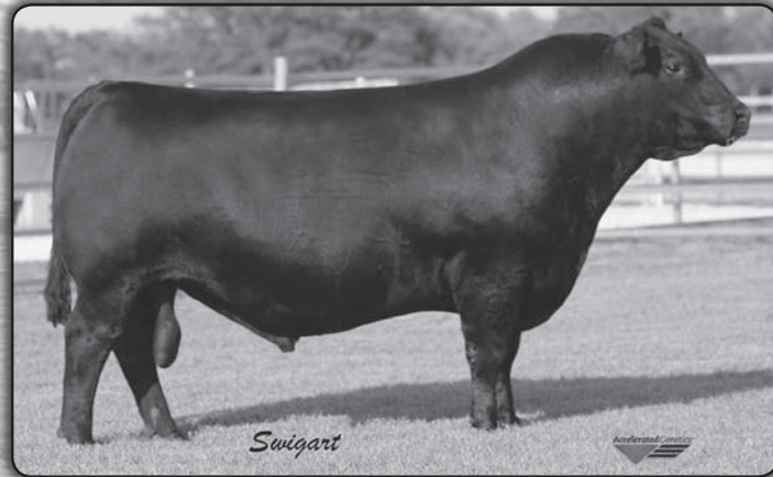
Werner War Party 2417 - Sire of Lot 32