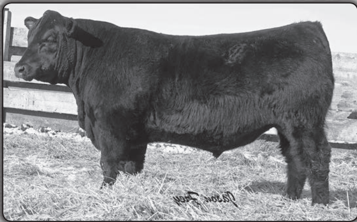
Ridl Big Sky 24 657 - Lot 10