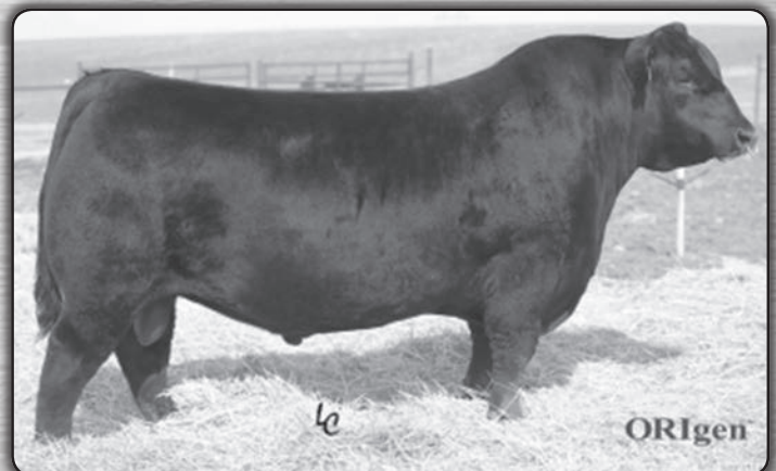
RB Tour of Duty 177 - Sire of Lot 47